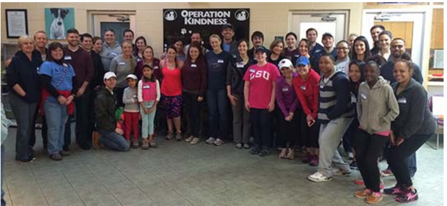
DAYL's February Generation Generosity Service event was held at Operation Kindness on February 21, 2015.