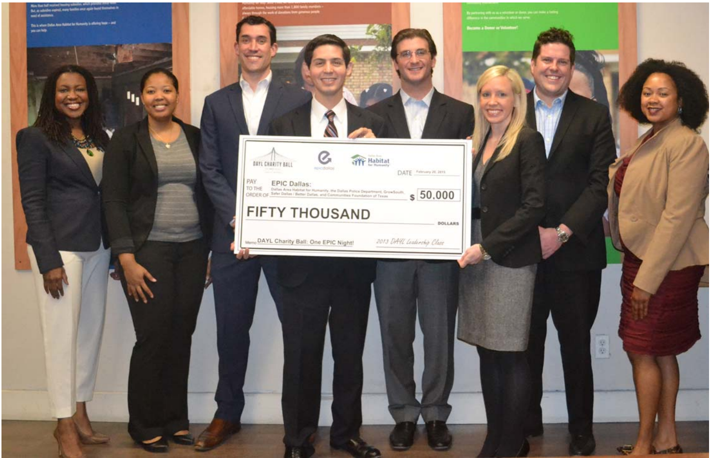
The 2013 DAYL Leadership Class recently presented a check for $50,000 to Dallas Area Habitat for Humanity and Economic Partners Investing in Communities (EPIC), two groups dedicated to fighting blight in Dallas. The money was raised at the DAYL Charity Ball, hosted by the 2013 DAYL Leadership Class on November 15, 2014. The event was a tremendous success, with close to 500 attendees. The DAYL is excited to announce that it will host a second annual DAYL Charity Ball this year on November 14, 2015 and hopes to raise even more money to support the work of these great organizations.