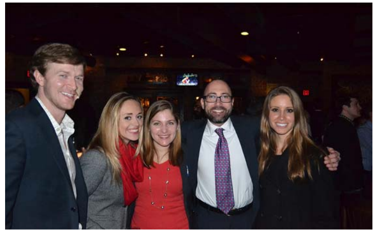
DAYL's February Social at The Standard Pour was a bit. Over 160 people attended the event!